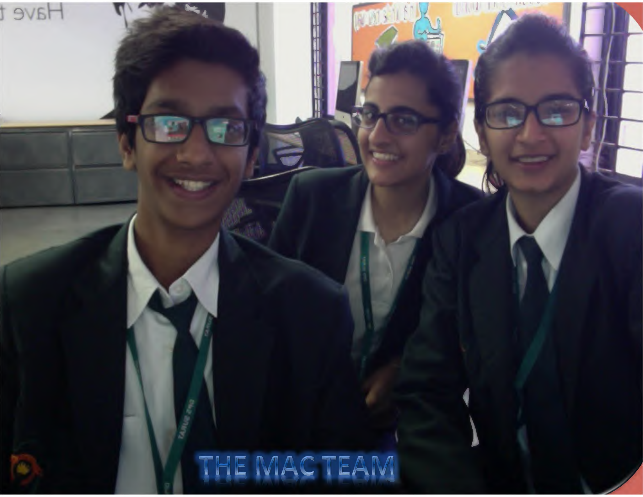
THE MAC TEAM